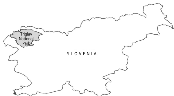
Figure 1. Location of the case study (Triglav National Park) in Slovenia

The climate of the area is continental, with cold winters and warm summers with frequent hot days. The average temperature in the warmest month range from 20°C in the valleys and 5.6°C in the mountains, and in the coldest month, the temperature ranges is between 0.7°C and –8.8°C. The average annual precipitation is about 1,500 mm (Pristov et al. 1998).